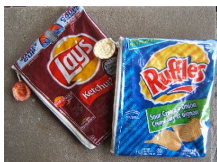
A finished pencil case.

Upcycling is when you take something that was going to be thrown away and re-purpose it. One thing we always have leftover from student lunches is chip bags. You can turn a chip bag into a pencil case to use for school! Start by taking a chip bag and cleaning it out so there are no crumbs or residue left inside.