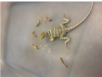
Meet Dart, our new Eastern Collared Lizard!

Ashley, or Ash, is a Vietnamese Potbelly Pig that we adopted after the Cranston Fire. She enjoys basking in the sun and rolling around in the mud in typical pig style!