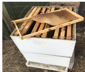
Bee Box in the Garden

while also engaging in hands-on learning activities that contribute to local pollinator research projects.