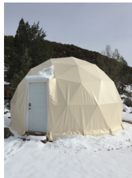
The Astronomy Dome

to those who donated to our February storm damage fund! If you're interested in learning more about this project or other opportunities to support us, you can visit pathfinderranch.com/donate .