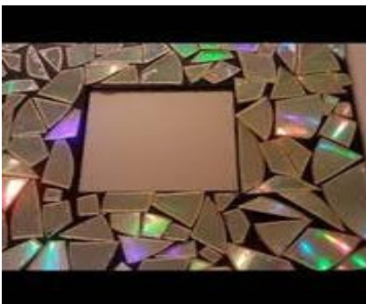
Upcycling old CDs and DVDs

Do you have old CDs or DVDs that you are no longer able to use but you don't want to throw out? Have no fear! Those CDs and DVDs can be repurposed into a flashy and fun frame for photos. First, take the discs and cut them up into varying sized pieces. For the frame base you can use cardboard with a square cut in the middle or you can just repurpose an existing frame. Next, you can